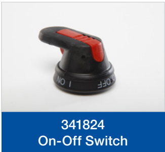
341824 On-Off Switch