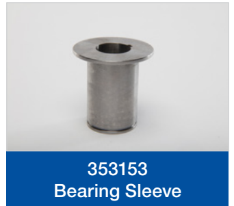
353153 Bearing Sleeve