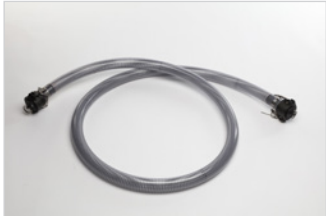
353464 Supply Hose