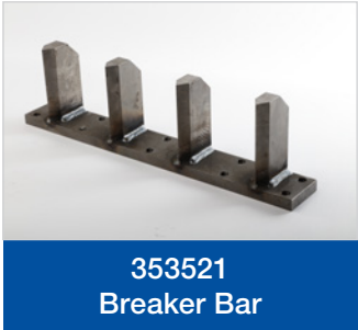
353521 Breaker Bar