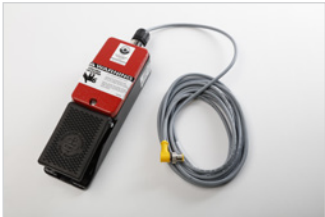
353243 Foot Pedal