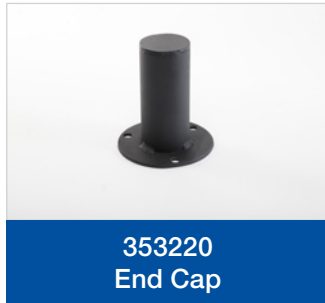
353220 End Cap