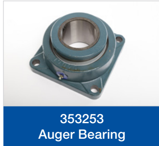
353253 Auger Bearing