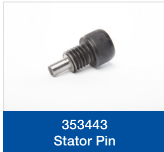
353443 Stator Pin