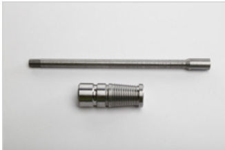
Extended Stem and Nozzle 353226 - Stem 353225 - Nozzle