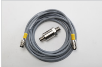
Pressure Sensor and Cable 353376 - Sensor 353465 - Cable