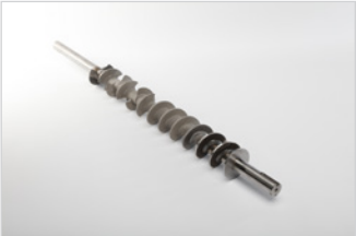
353291 Injector Screw