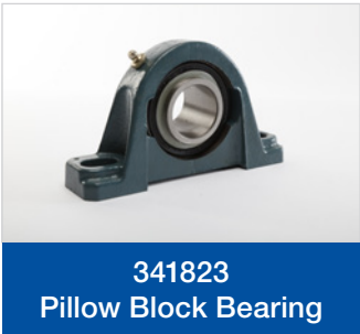
341823 Pillow Block Bearing