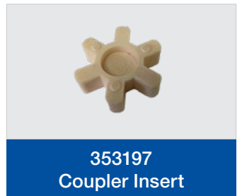
353197 Coupler Insert