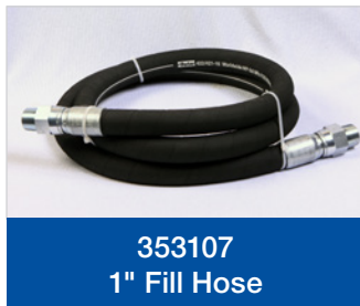
353107 1" Fill Hose