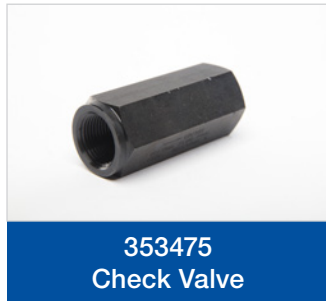
353475 Check Valve