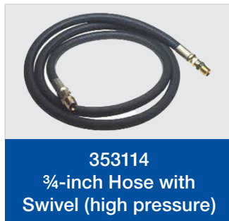
353114 3/4-inch Hose with Swivel (high pressure)