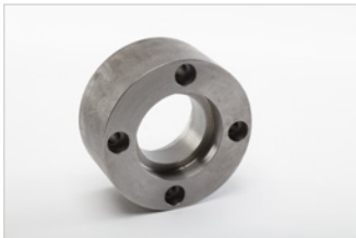
353150 Bearing Housing