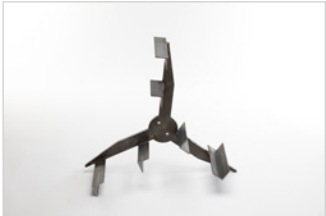
341827 Fluffer Bar