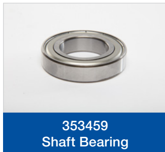
353459 Shaft Bearing