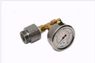
353235 Gauge Assembly