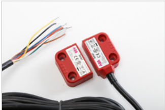
353419 Safety Switch