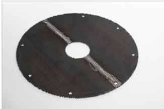
353407 Grinder Screen