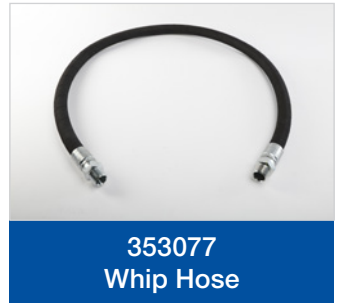
353077 Whip Hose