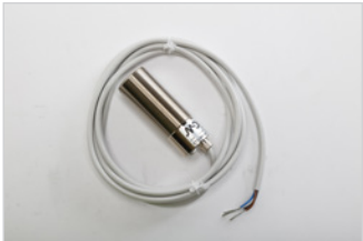
353199 Crumb Sensor