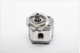
353477 Gear Pump