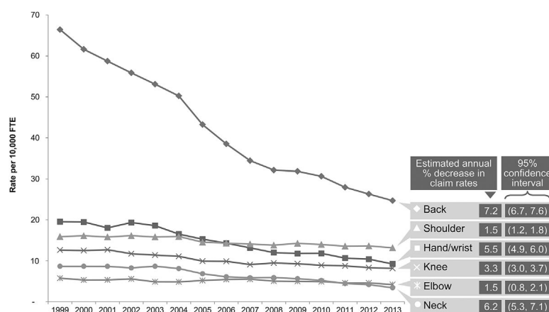
FIGURE 2 Trends in Washington State workers' compensation compensable claim rates due to WMSDs by body part and year, 1999-2013. WMSD = work-related musculoskeletal disorder; Compensable claim = injured/ill worker must be medically certified as unable to perform normal work duties beyond a three calendar day waiting period not including the date of injury

Compensable claims due to WMSDs are presented by two-digit NAICS industry sector and rank ordered by the Prevention Index (PI) in Table 3. The top five industry sectors ranked by PI, a combination of rankings by frequency count and rate per FTE, were as follows: Construction; Transportation and Warehousing; Health Care and Social Assistance; Manufacturing; and Public Administration. The Mining, Quarrying, and Oil and Gas Extraction sector had a relatively high incidence rate, fourth highest when ranking by rate, but a relatively low claims frequency count. WMSD claims among all sectors, except Management of Companies and Enterprises, significantly, decreased during the study period. The largest annual decrease in WMSD claims was observed among those in Finance and Insurance