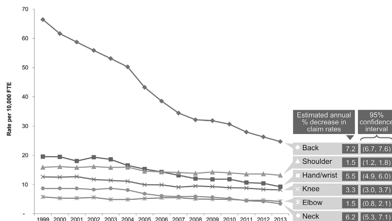
FIGURE 2 Trends in Washington State workers' compensation compensable claim rates due to WMSDs by body part and year, 1999-2013. WMSD = work-related musculoskeletal disorder; Compensable claim = injured/ill worker must be medically certified as unable to perform normal work duties beyond a three calendar day waiting period not including the date of injury

Compensable claims due to WMSDs are presented by two-digit NAICS industry sector and rank ordered by the Prevention Index (PI) in Table 3. The top five industry sectors ranked by PI, a combination of rankings by frequency count and rate per FTE, were as follows: Construction; Transportation and Warehousing; Health Care and Social Assistance; Manufacturing; and Public Administration. The Mining, Quarrying, and Oil and Gas Extraction sector had a relatively high incidence rate, fourth highest when ranking by rate, but a relatively low claims frequency count. WMSD claims among all sectors, except Management of Companies and Enterprises, significantly, decreased during the study period. The largest annual decrease in WMSD claims was observed among those in Finance and Insurance